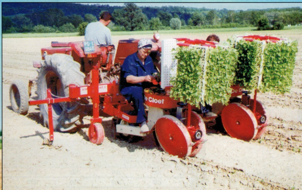
TCD 2 rows