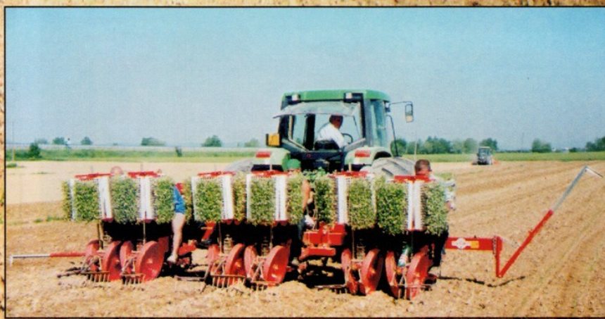
TCD 6 rows