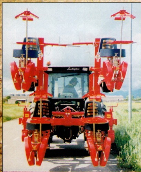
TCD 4 rows transport position