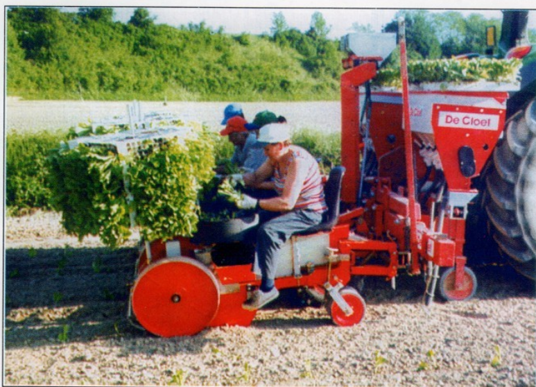
TCD 4 rows